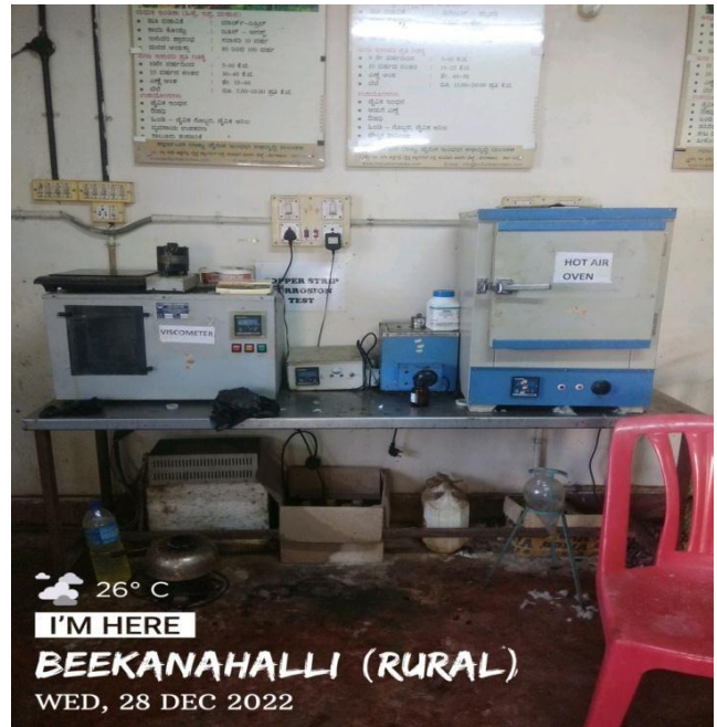
2. Hot Air oven and Viscometer