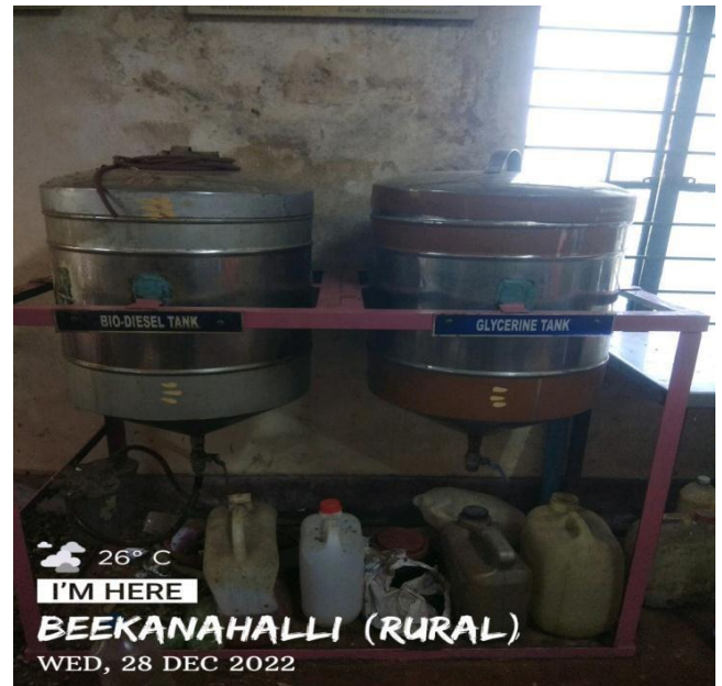
4. Bio diesel tank and Glycerin tank