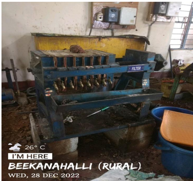
3. Seperation Tank and Filter Unit