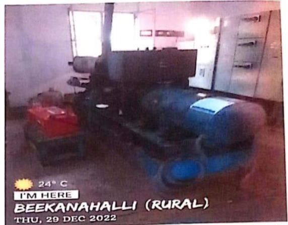
C-Block, 50 kv Generator , Electrical, Electronics and Computer science Block