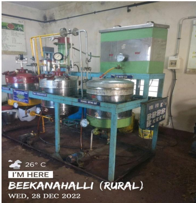
1. Trasn: Esterification Unit