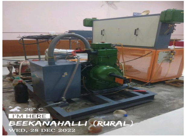
Computerized diesel Engine Test Rig.