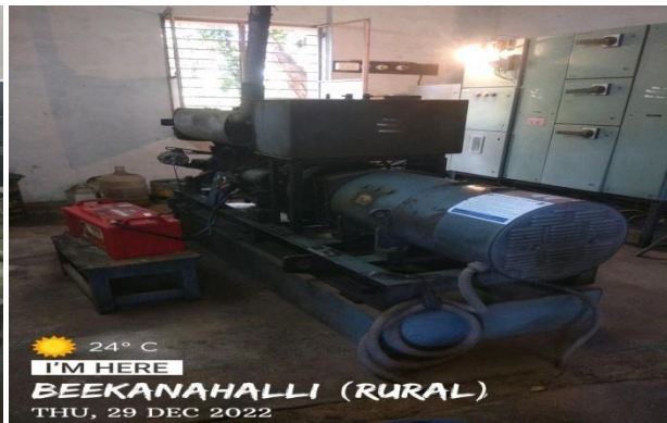
B-Block ,50 kv Generator, Mechanical and Civil block