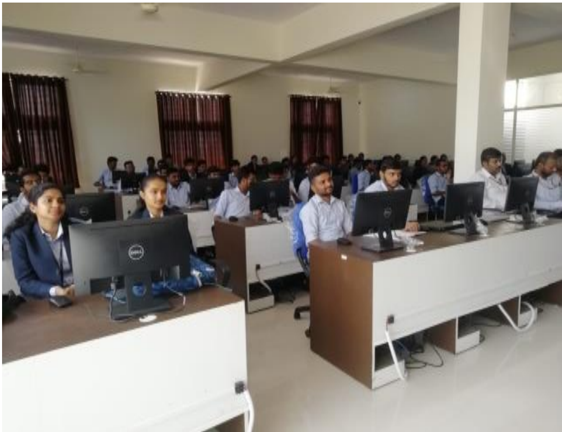
Photograph of conduction of ADD-ON Course

Introduction to Artificial Intelligence, Machine Learning, Python, Python for AI & ML, Machine Learning Models etc.