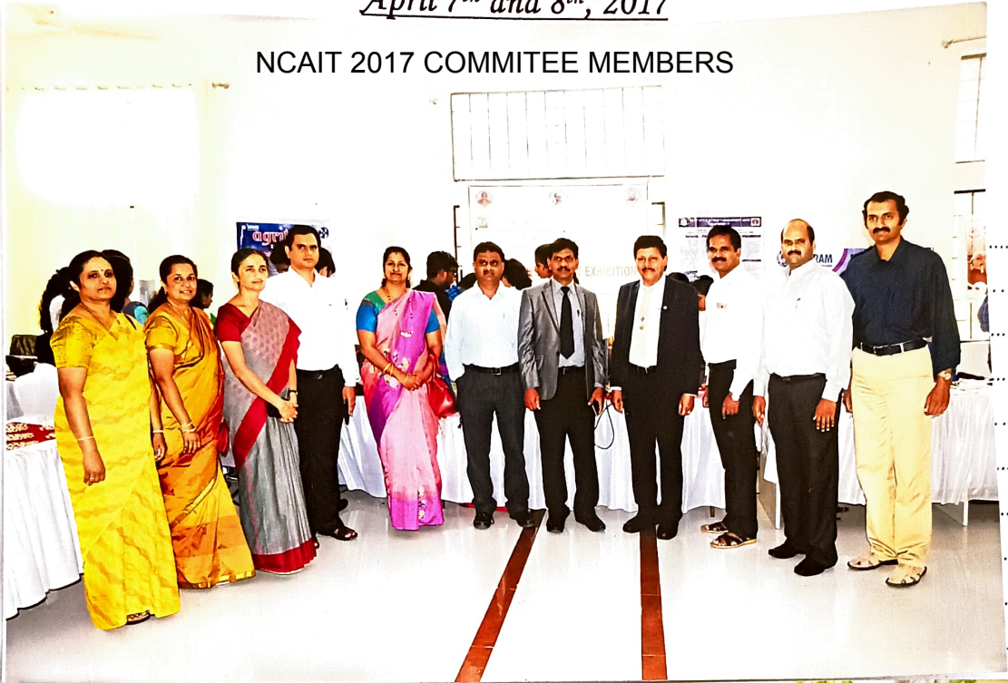
NCAIT 2017 COMMITTEE MEMBERS