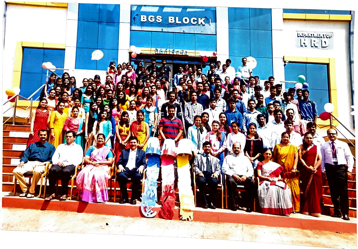
NATIONAL CONFERENCE ON EMERGING TRENDS AND ADVANCES IN INFORMATION TECHNOLOGY 2017- PARTICIPANTS PHOTO