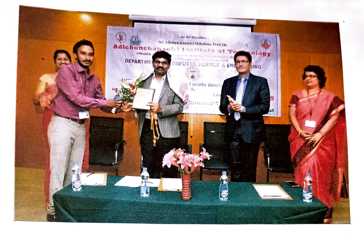
AICETE SPONSERED TWO WEEKS FDP ON EMERGING TRENDS IN MEDICAL IMAGE PROCESSING AND ITS APPLICATION TALK GIVEN BY OUR PRINCIPAL